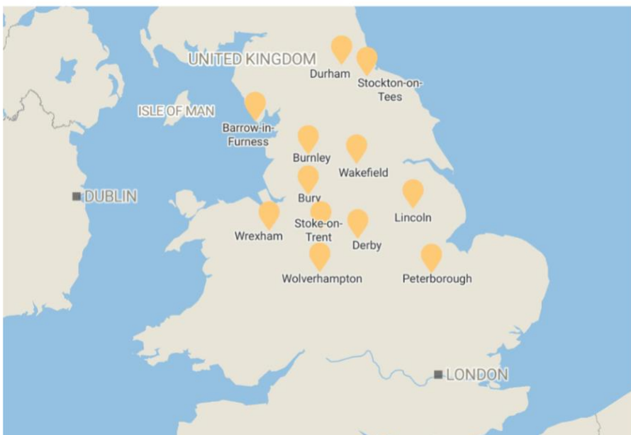
Figure 3 – Map showing red wall areas receiving LUF